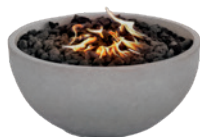
A. Fire bowl