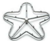
B. Gas insert